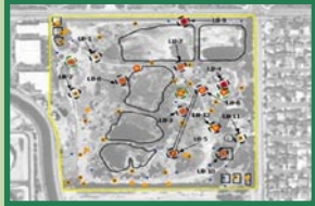
Site Aerial Analysis