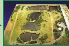
Scale Model Construction for Project Planning