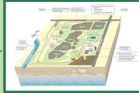
Storyboarding and Illustration