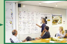
Project Advocacy, Consulting and Engineering